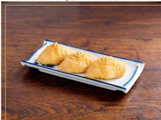
Inari sushi ¥300