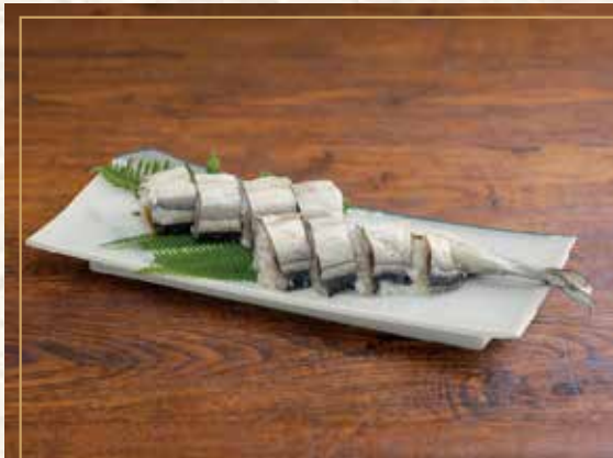
Nare sushi ¥720