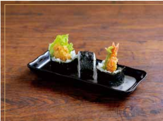
Shrimp Fry Roll ¥610