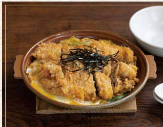
Yamato Pork cutlet hot pot