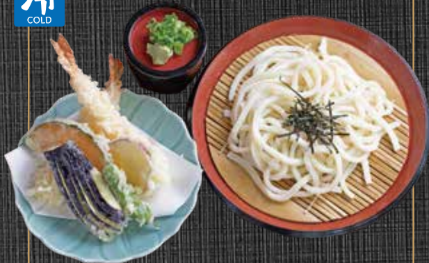
Tempura zaru udon Set meal ¥1,650 single menu ¥1,300