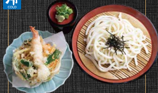
Kakiage zaru udon Set meal ¥1,400 single menu ¥1,050