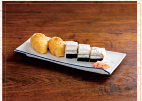
Sushi set ¥500