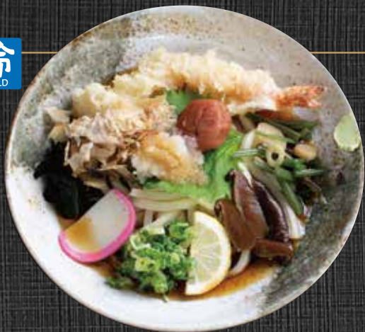
Kodo udon Set meal ¥1,550 single menu ¥1,200