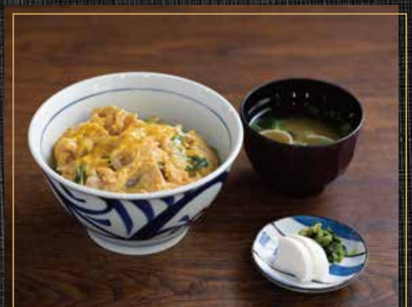
Chicken and egg rice bowl ¥ 880