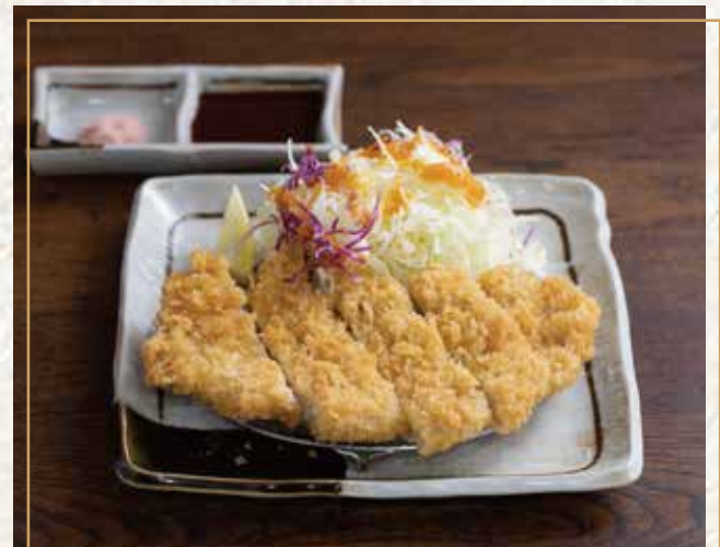
Yamato Pork loin