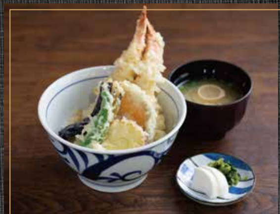
Tempura rice bowl ¥ 1,320