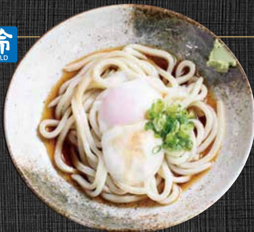
bukkake with grated yam udon Set meal ¥1,350 single menu ¥1,000