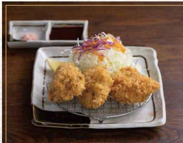
Yamato Pork fillet

The Kishu plum pork is raised on feed mixed with plum vinegar extract from Wakayama, resulting in a savory flavor without any unpleasant porky smell and a refreshing, pleasant texture. Compared to ordinary pork, it contains a higher amount of nutrients such as oleic acid.