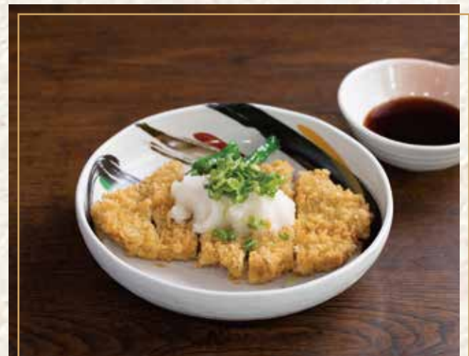
Yamato Pork grated daikon cutlet