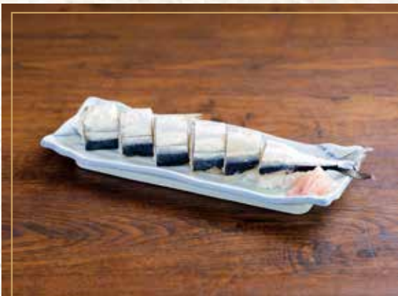
Sanma sushi ¥610