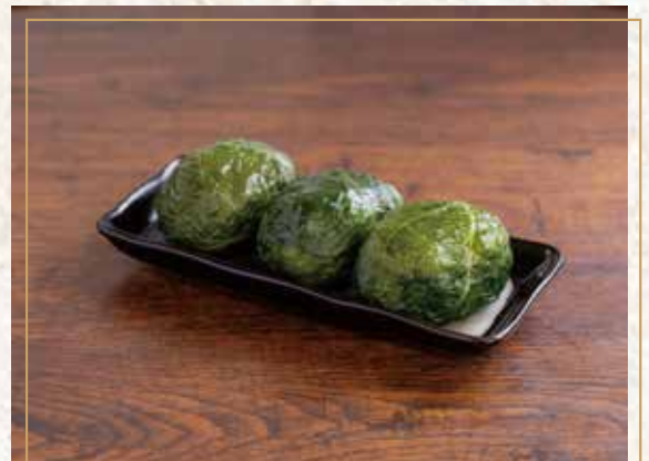
Mehari sushi ¥610 You can order from one piece ¥220