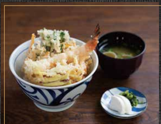
Mixed vegetable and shrimp rice bowl ¥ 1,050