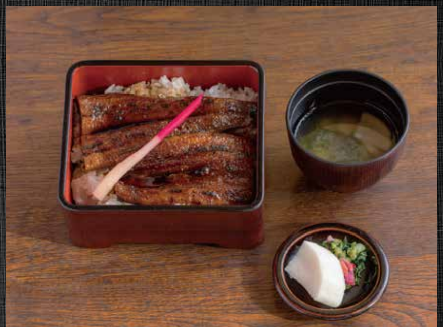
Kagoshima-produced Unadon ¥ 2,640