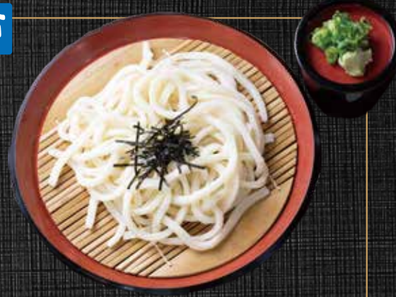
Zaru udon Set meal ¥1,010 single menu ¥660