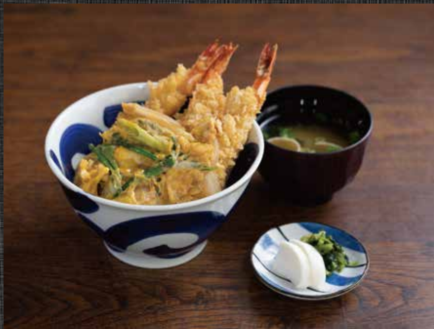
Shrimp tempura rice bowl ¥ 1,210